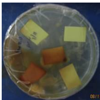
Figure 2. HCN production by VM-2

Among the four strains screened, except for VM-8 strain, the other three strains (VM-2, VM-9 and VM-15) produced HCN. Among these three strains VM-2 and VM-15 showed strong HCN production by a change in colour of filter paper from yellow to reddish brown (Figure 2) and Strain VM-9 showed low HCN production by change in colour of filter paper from yellow to light brown (Table 5). Control plate did not show any colour (Figure 3).