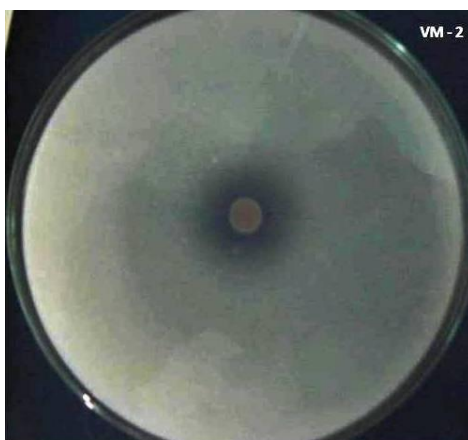
Figure 1. Phosphate solubilised zone of Rhizobium strain VM-2

Notes: Each value in the table is an average of three replicates F-calculated (5.637); F-tabulated (2.295); significant at 5% level